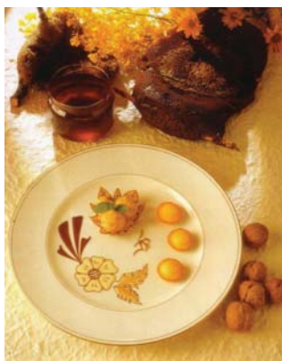
'Glace Miel Noix en Tulipe' (Honey and Walnut Icecream in Tulipan)