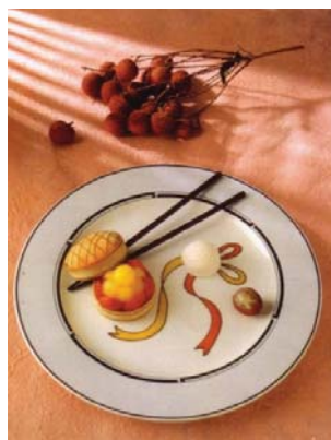
'L'Assiette de Hong-Kong' (Hong Kong Steam Pot)