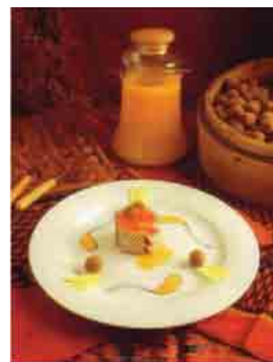
'Mousse Napoléon' (Napoléon Mousse)