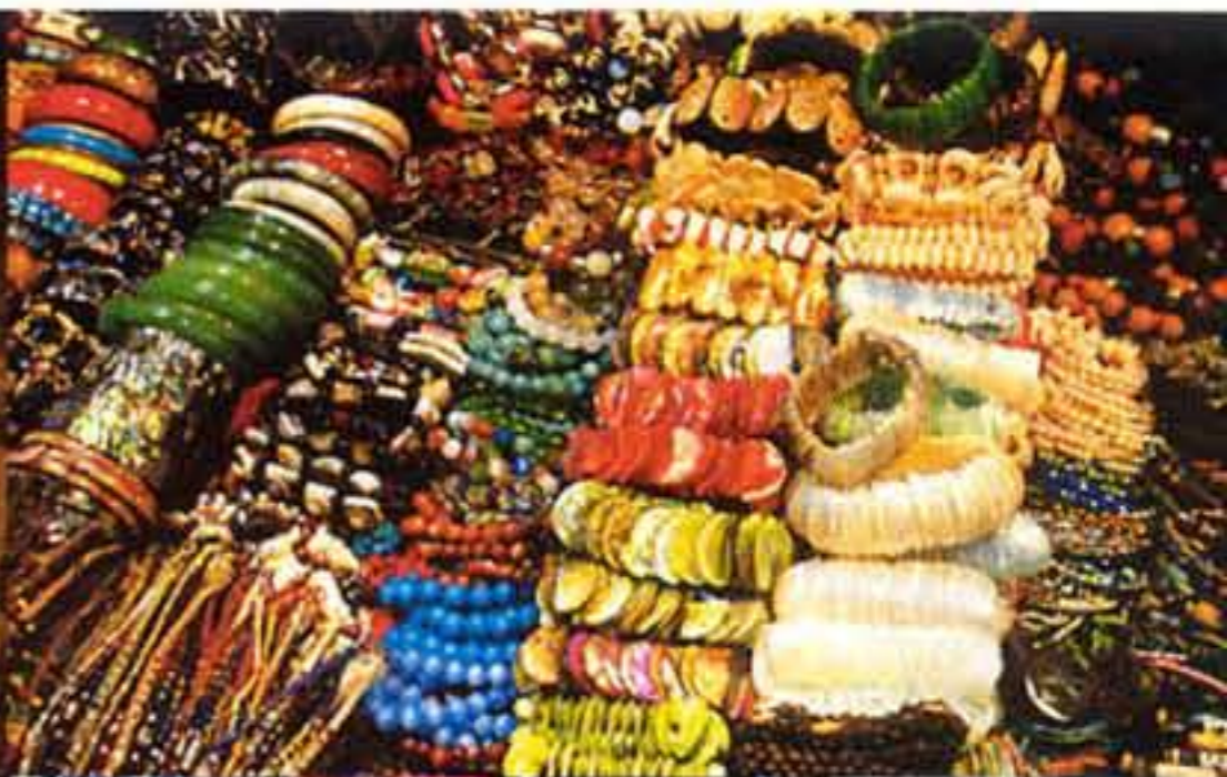
Clockwise from above: Monkey cave in North Phuket; trinkets at a Phuket street shop; Bangkok is famous for its colourful taxis; Bangkok's plush Gaysorn Mall